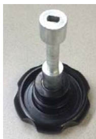
Manual operation tool